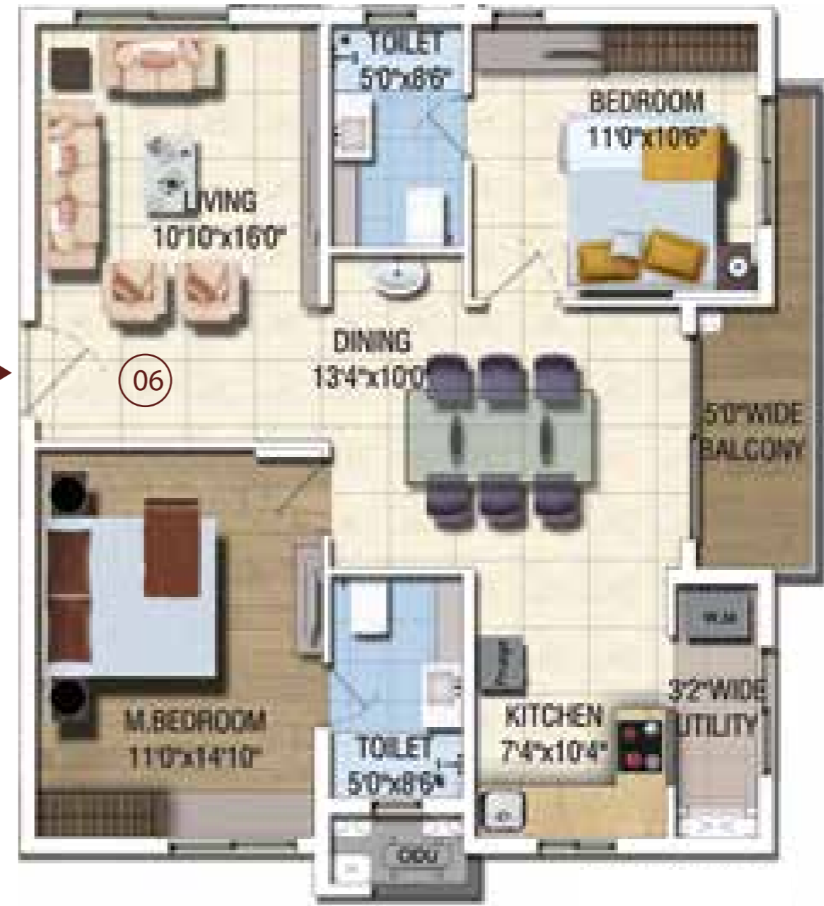
SBA - 1220 sft