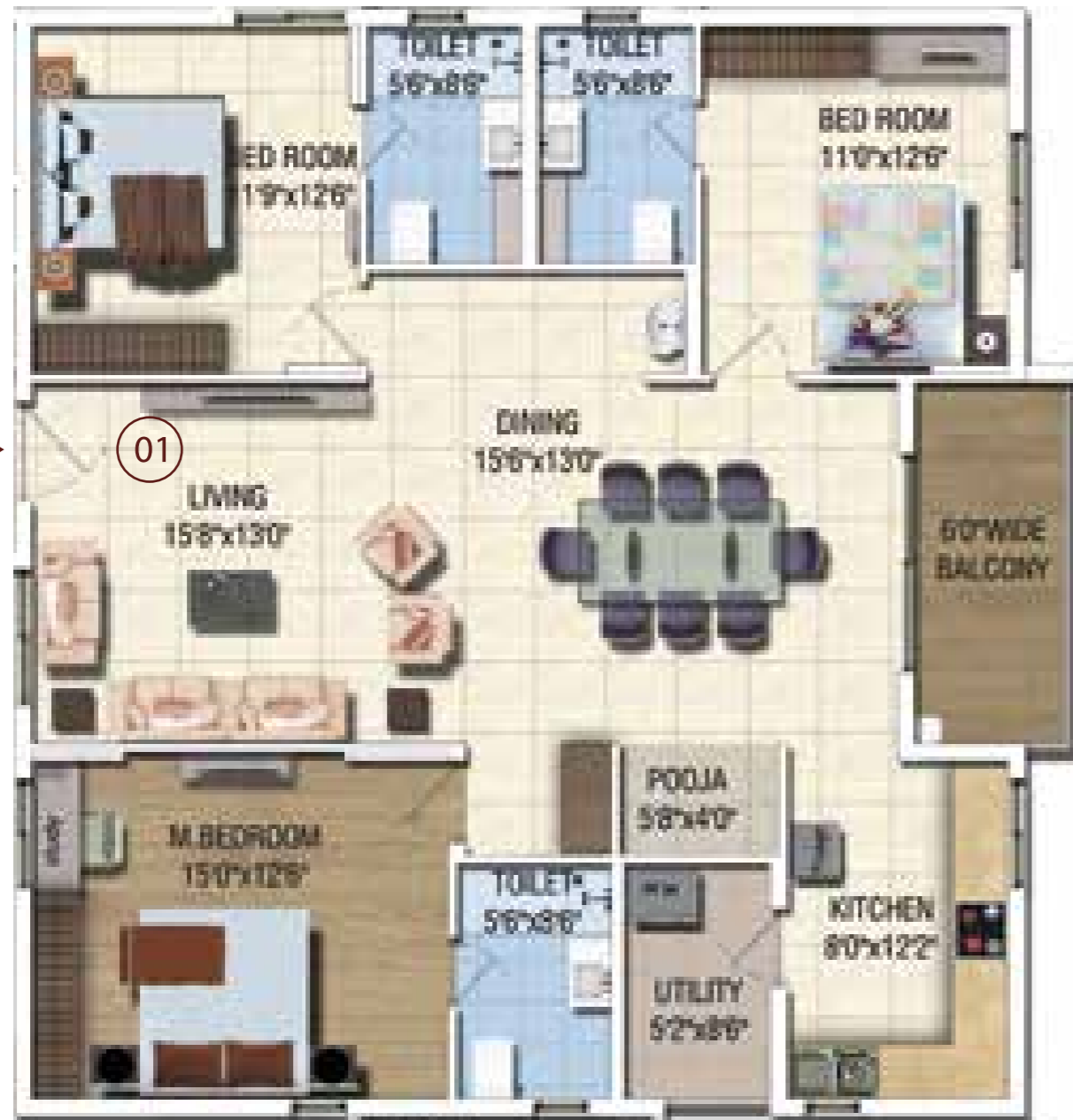
SBA - 1870 sft