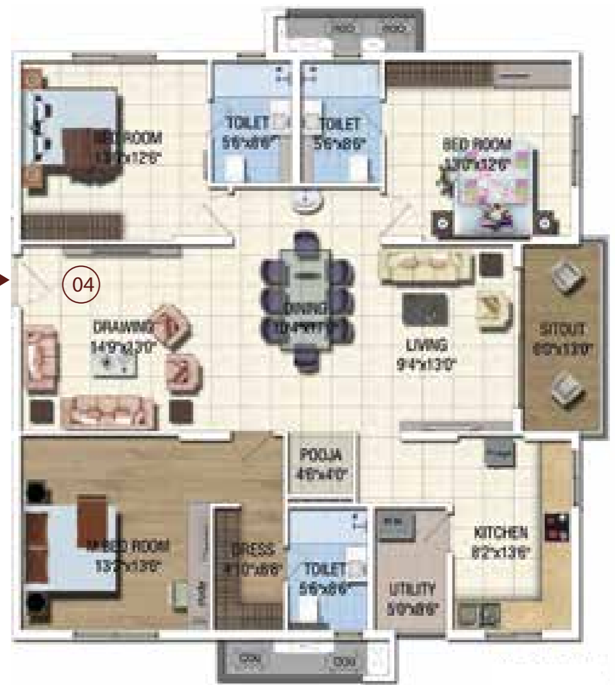
SBA - 2070 sft