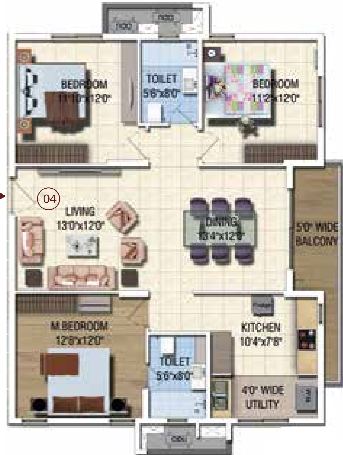
SBA - 1520 sft