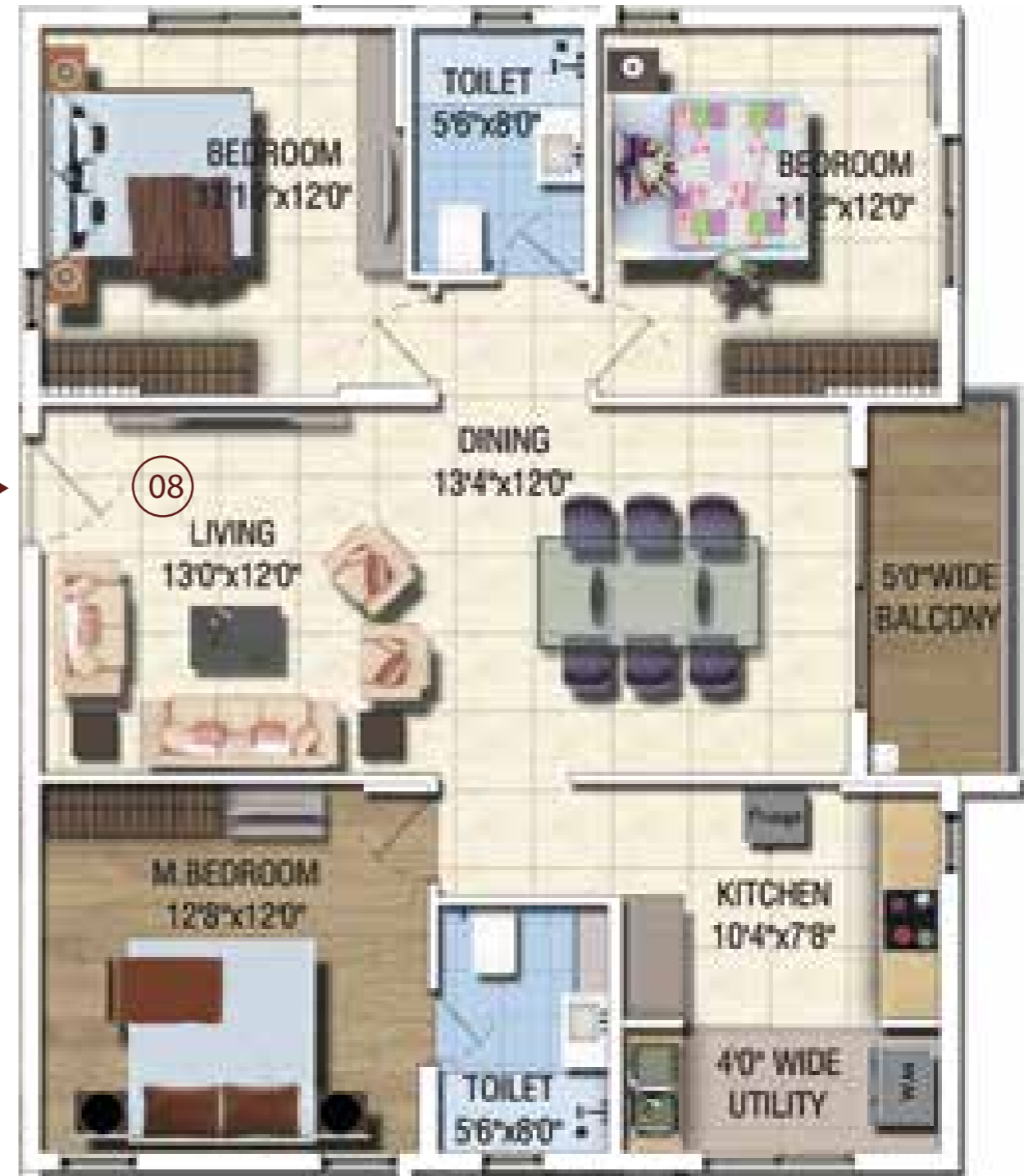
SBA - 1495 sft