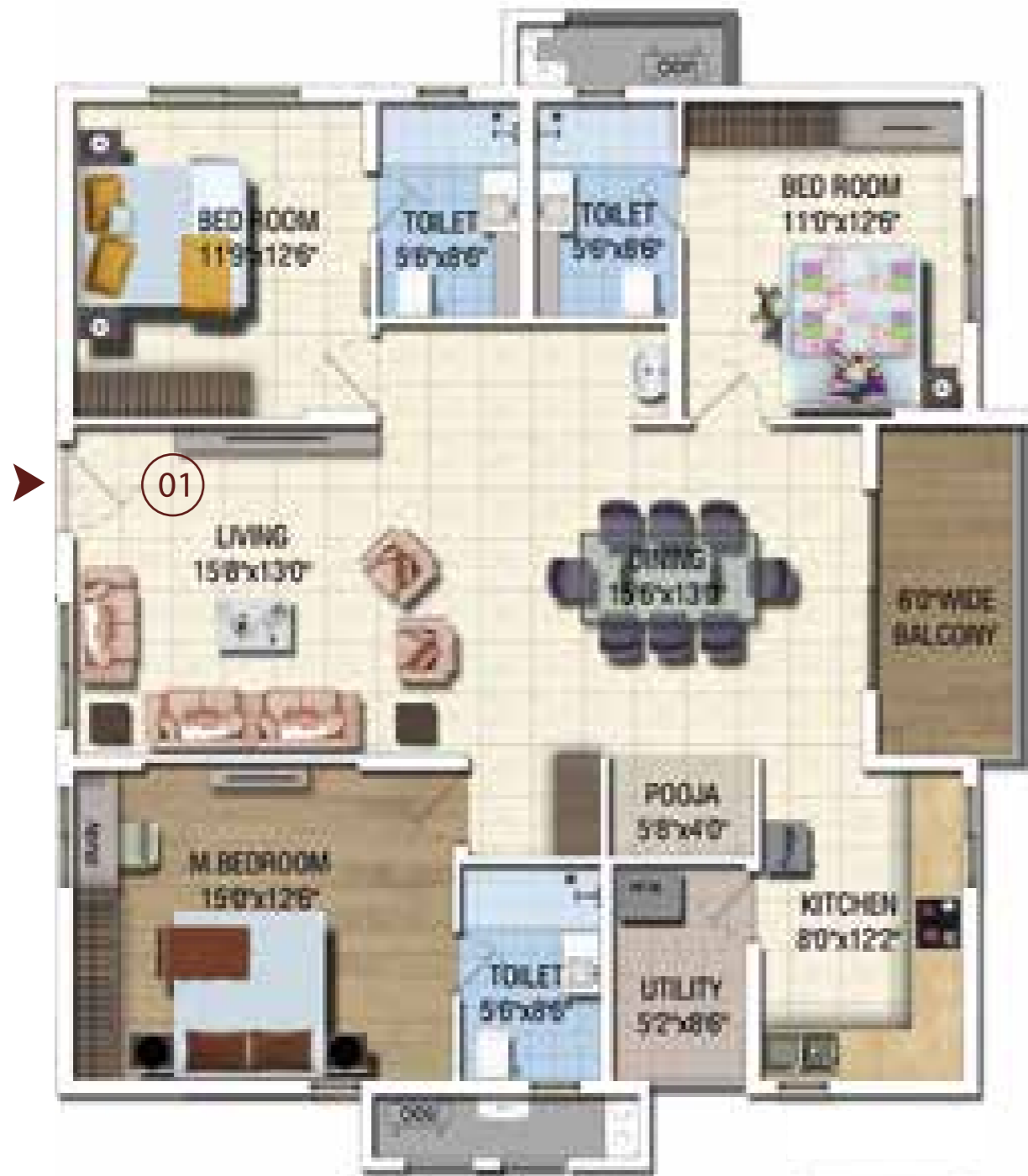
SBA - 1865 sft