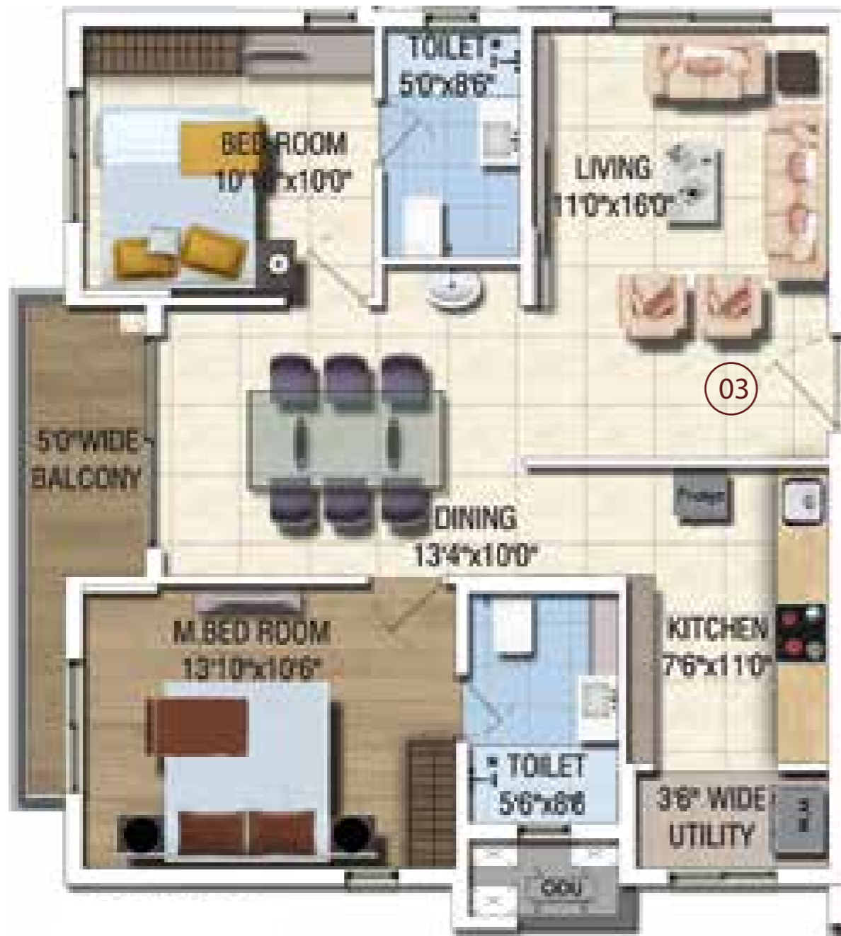
SBA - 1220 sft