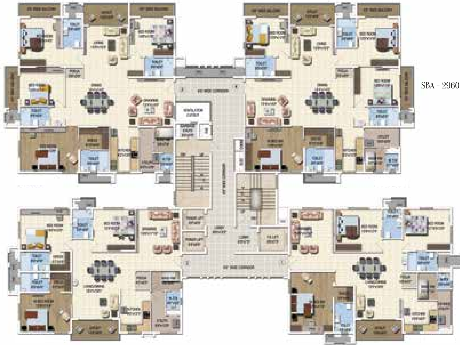
3, 5, 7, 9, 11, 13, 15 TO 23 - FLOOR PLAN