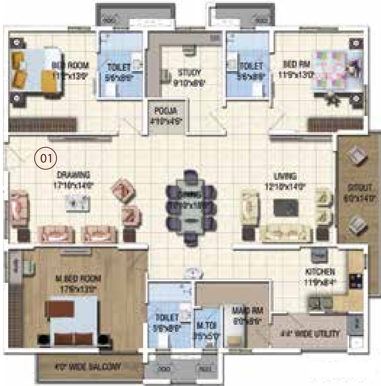
SBA - 2595 sft