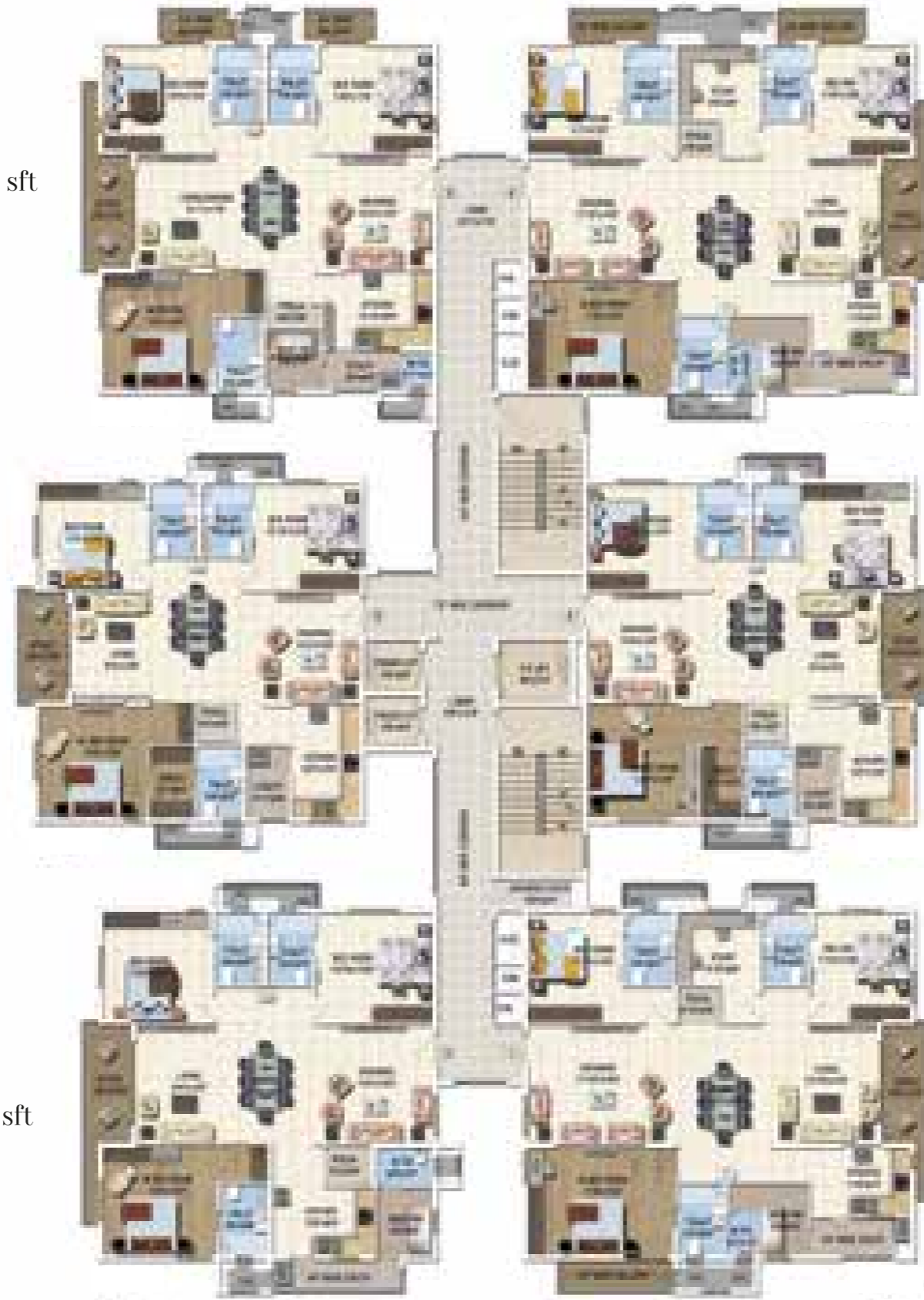
3, 5, 7, 9 - FLOOR PLAN