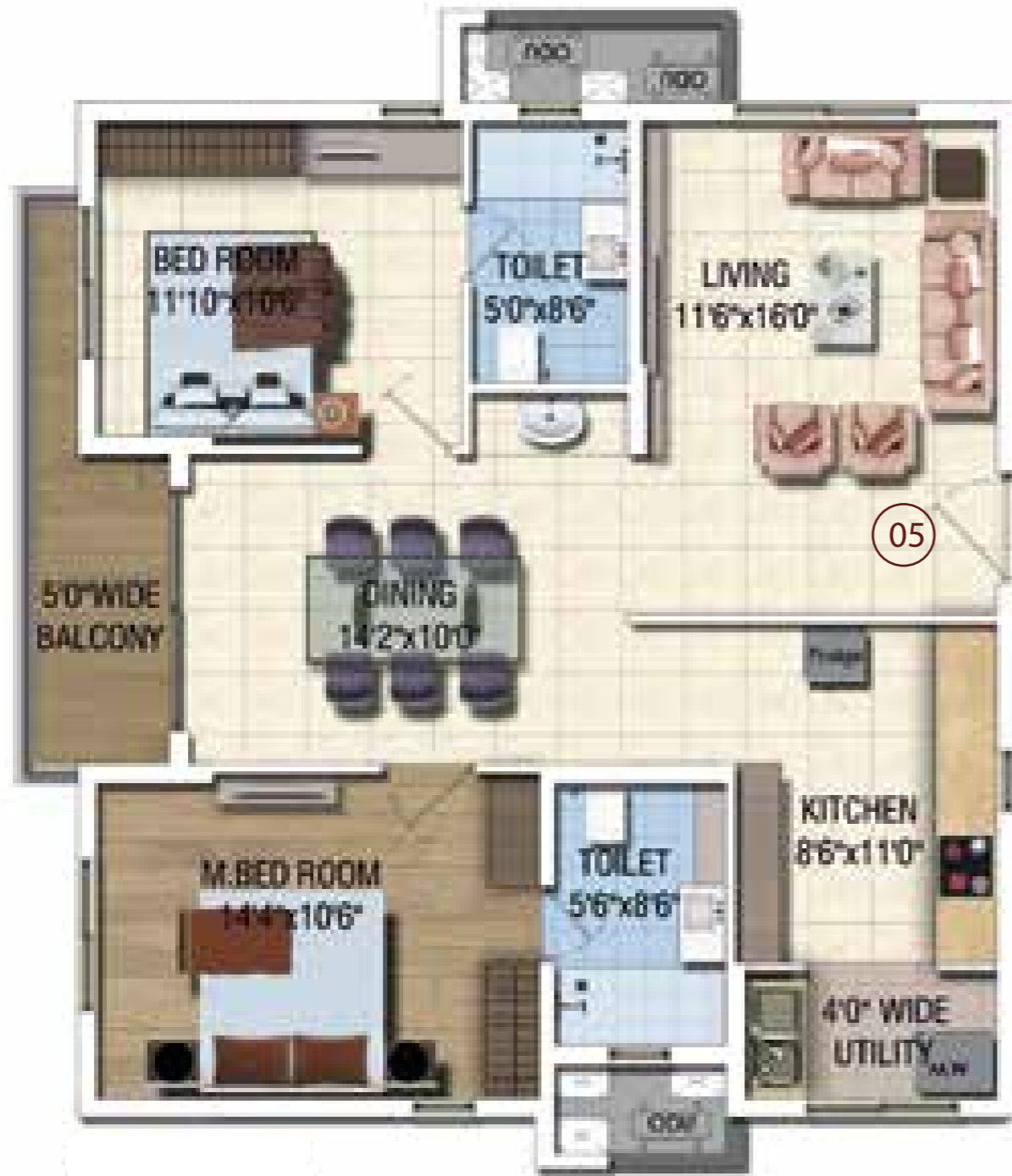
SBA - 1300 sft