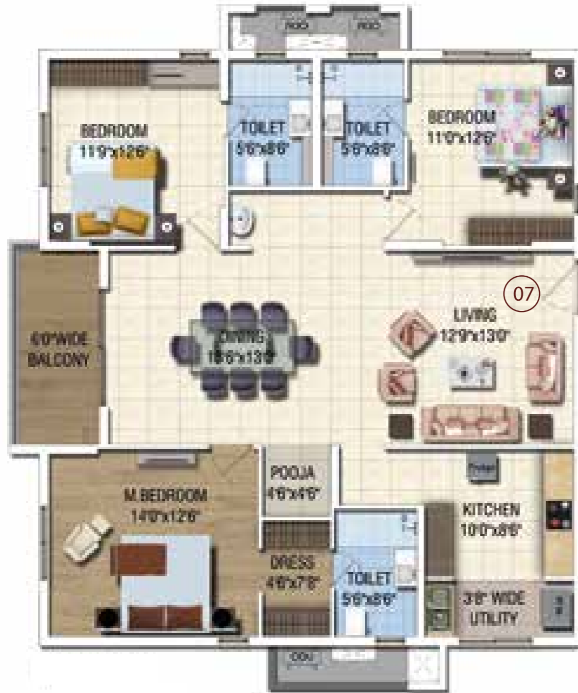
SBA - 1865 sft