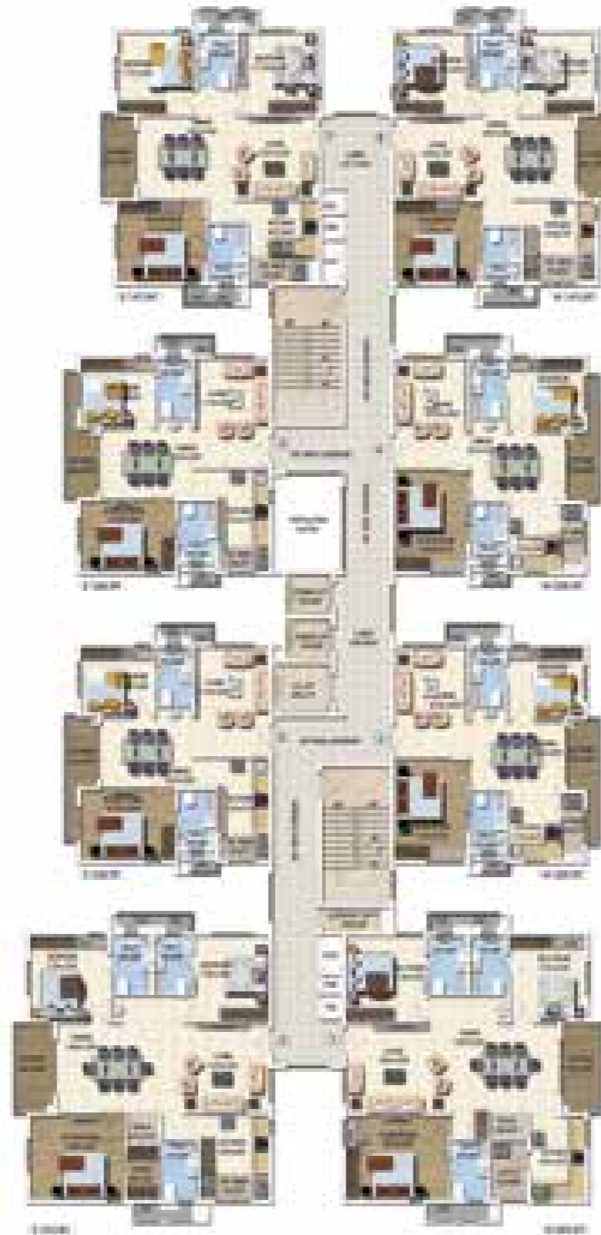
3, 5, 7, 9 - FLOOR PLAN