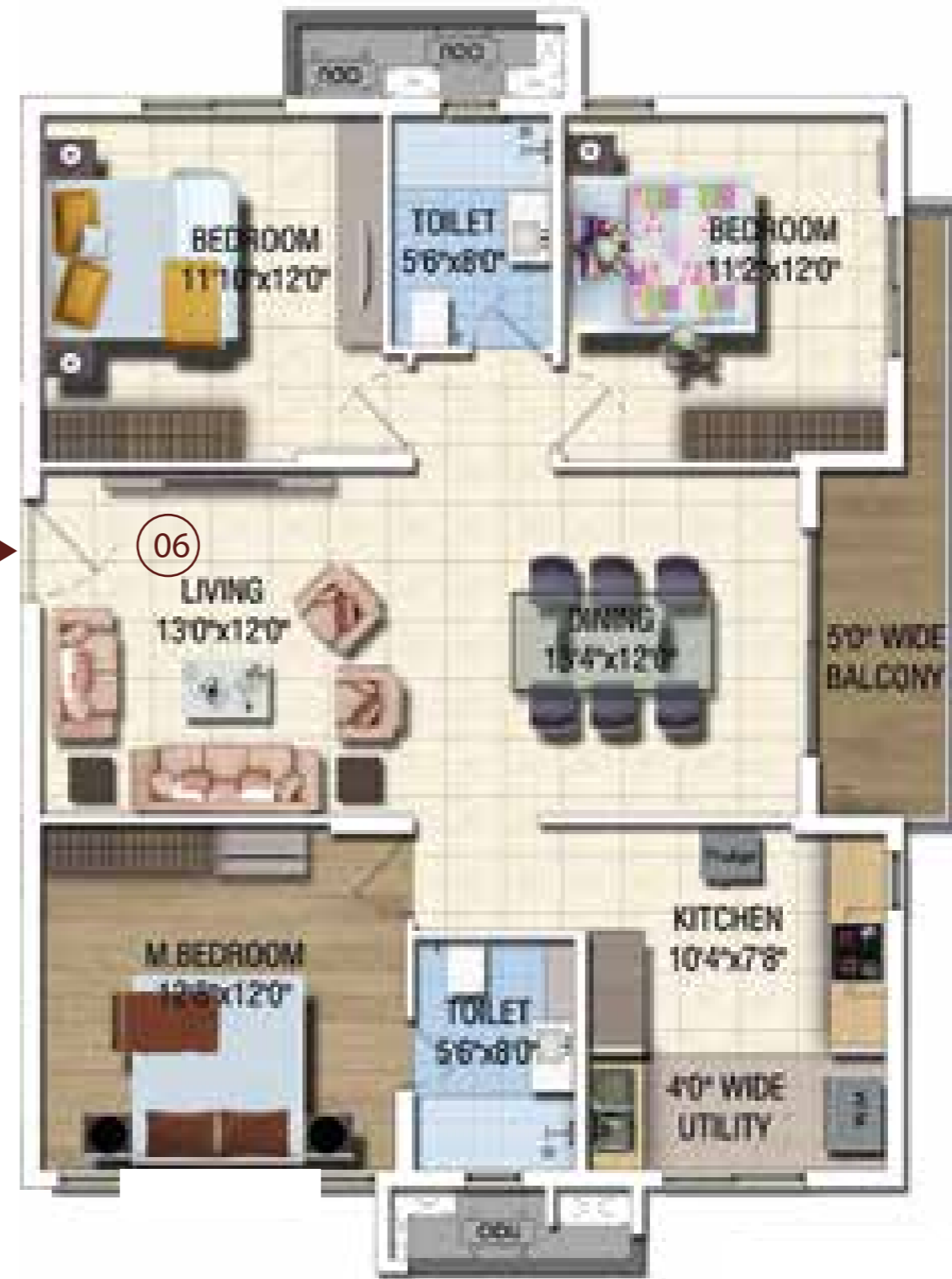
SBA - 1520 sft