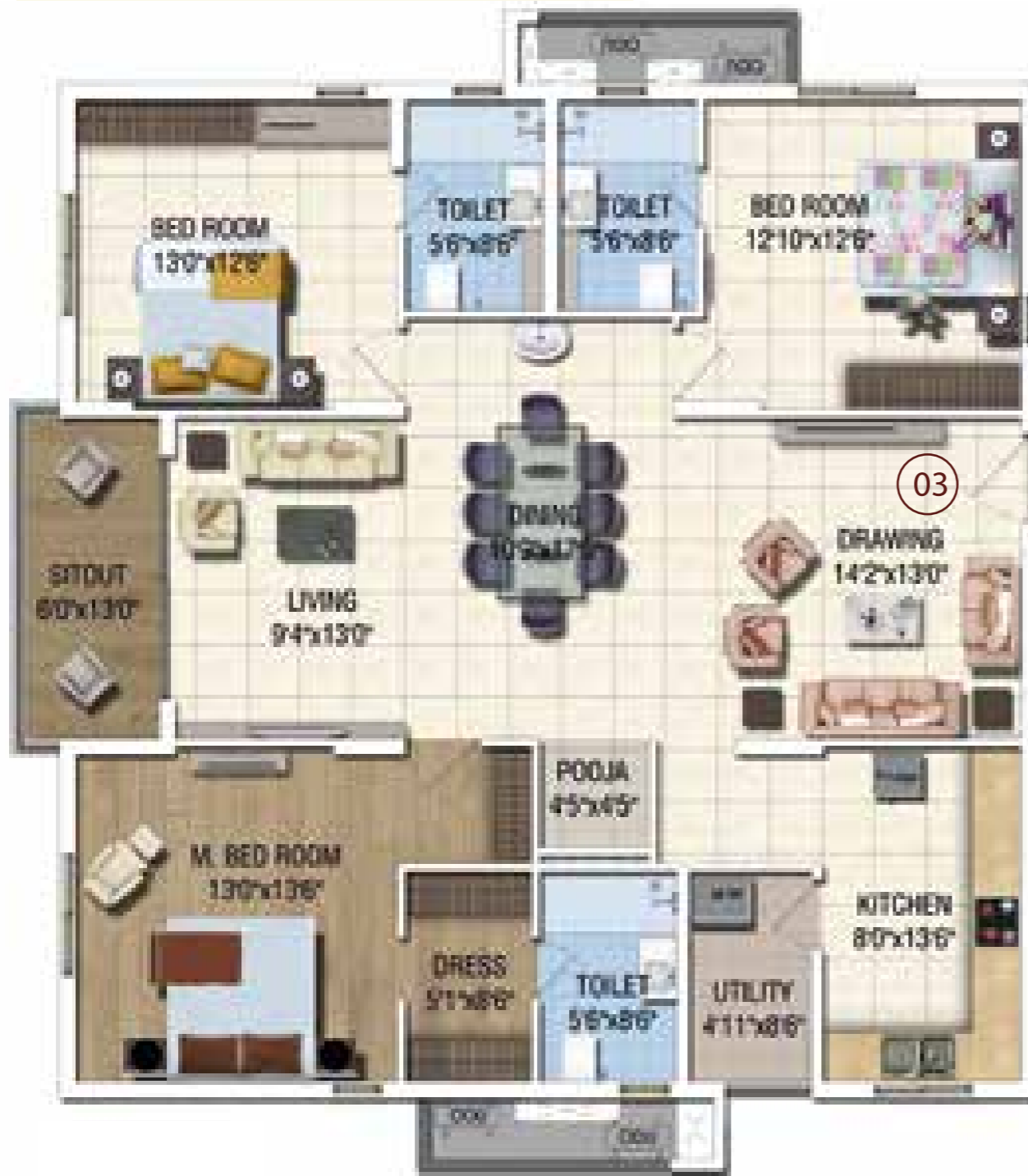
SBA - 2065 sft