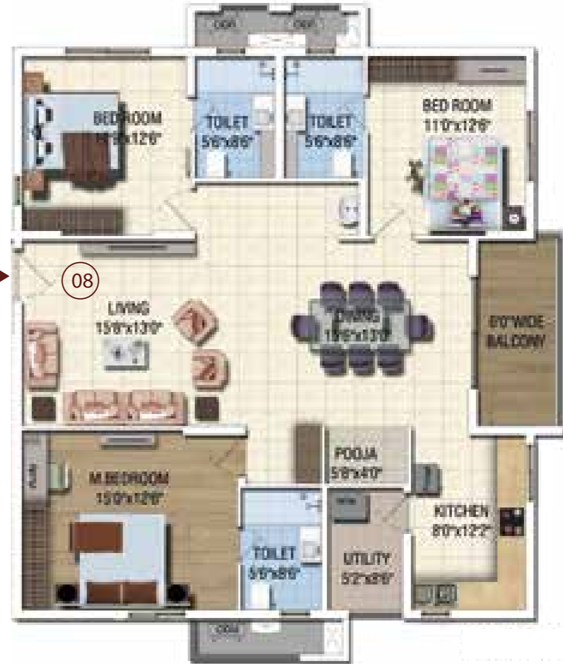
SBA - 1865 sft