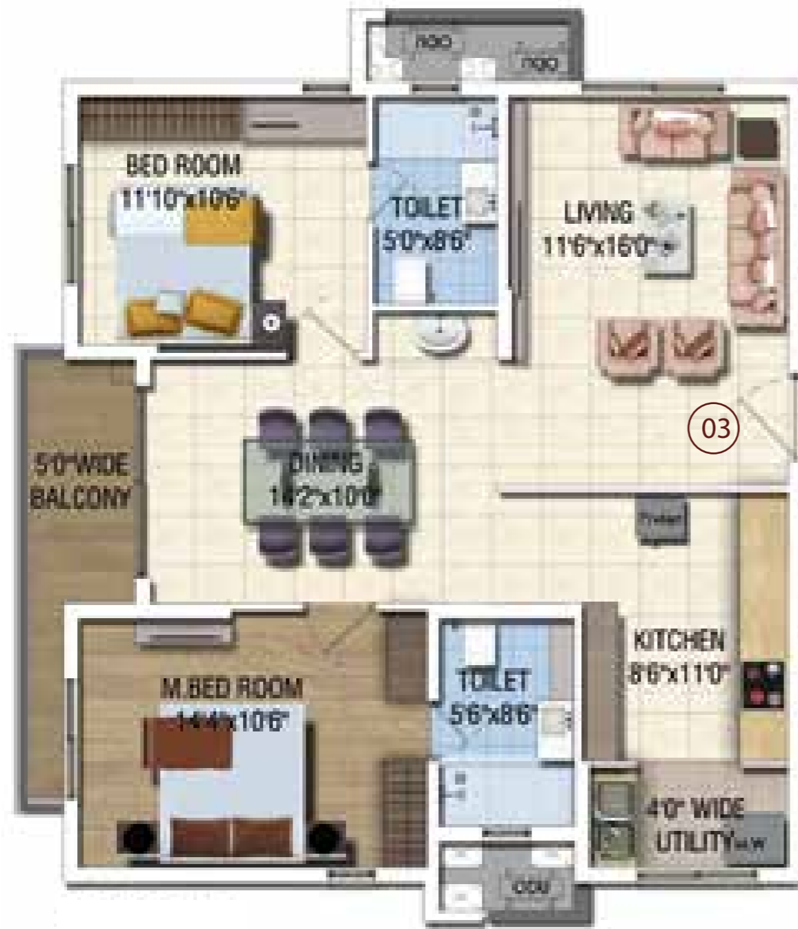
SBA - 1300 sft