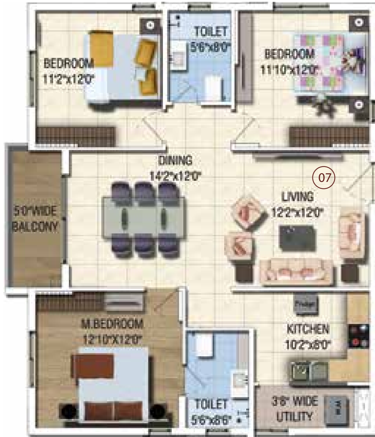
SBA - 1495 sft