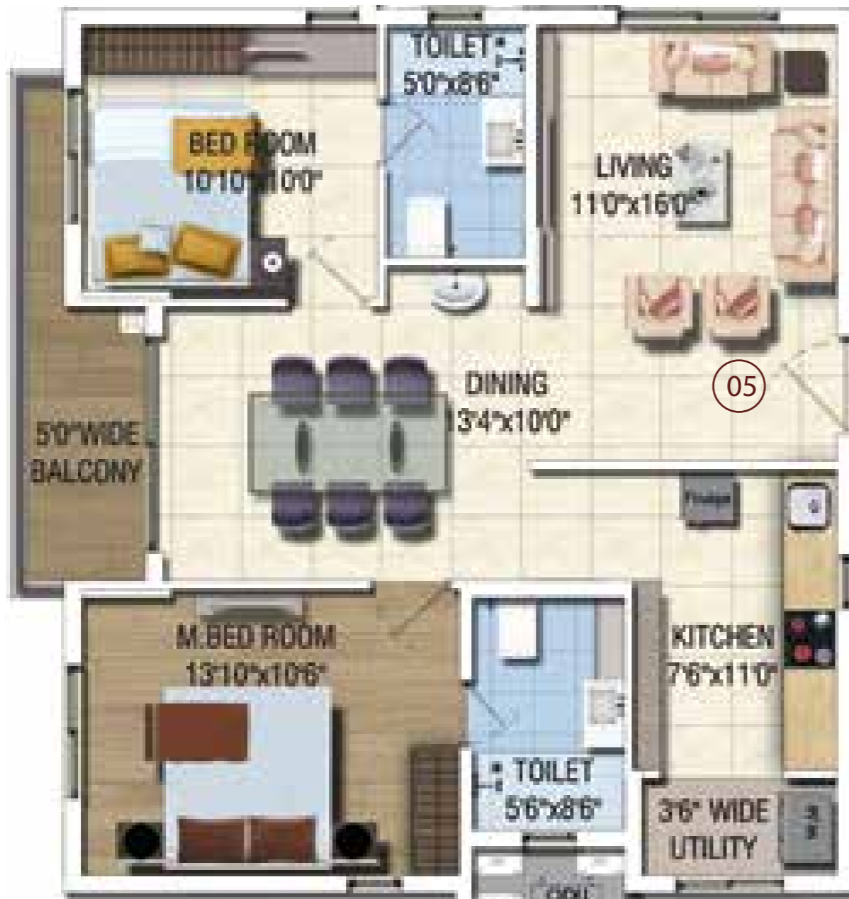
SBA - 1220 sft