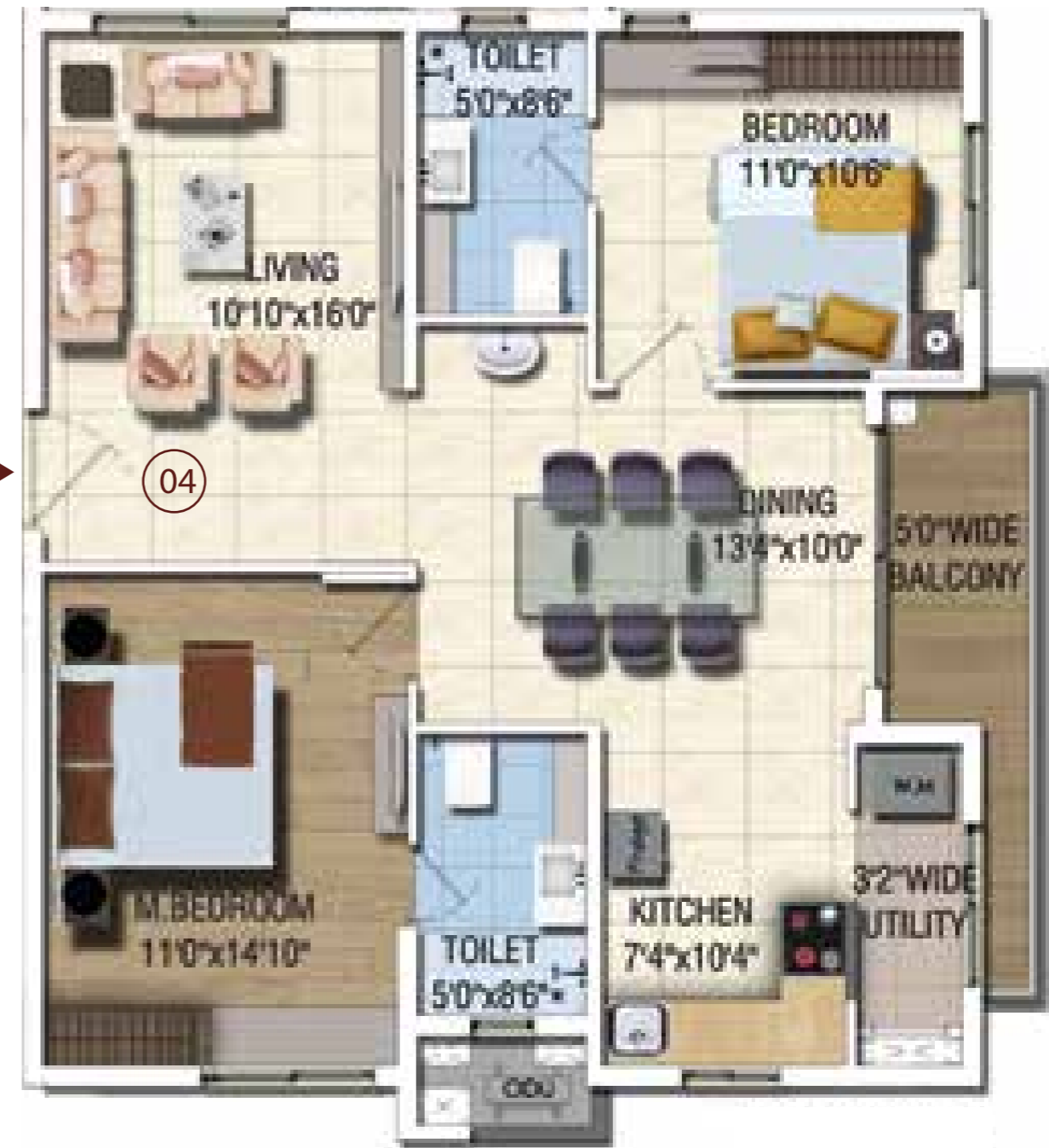
SBA - 1220 sft