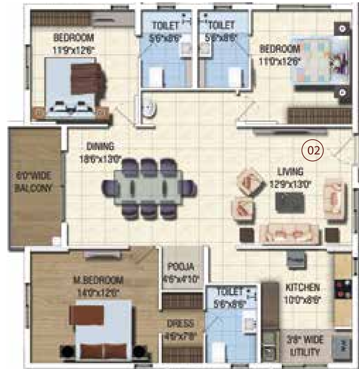
SBA - 1865 sft