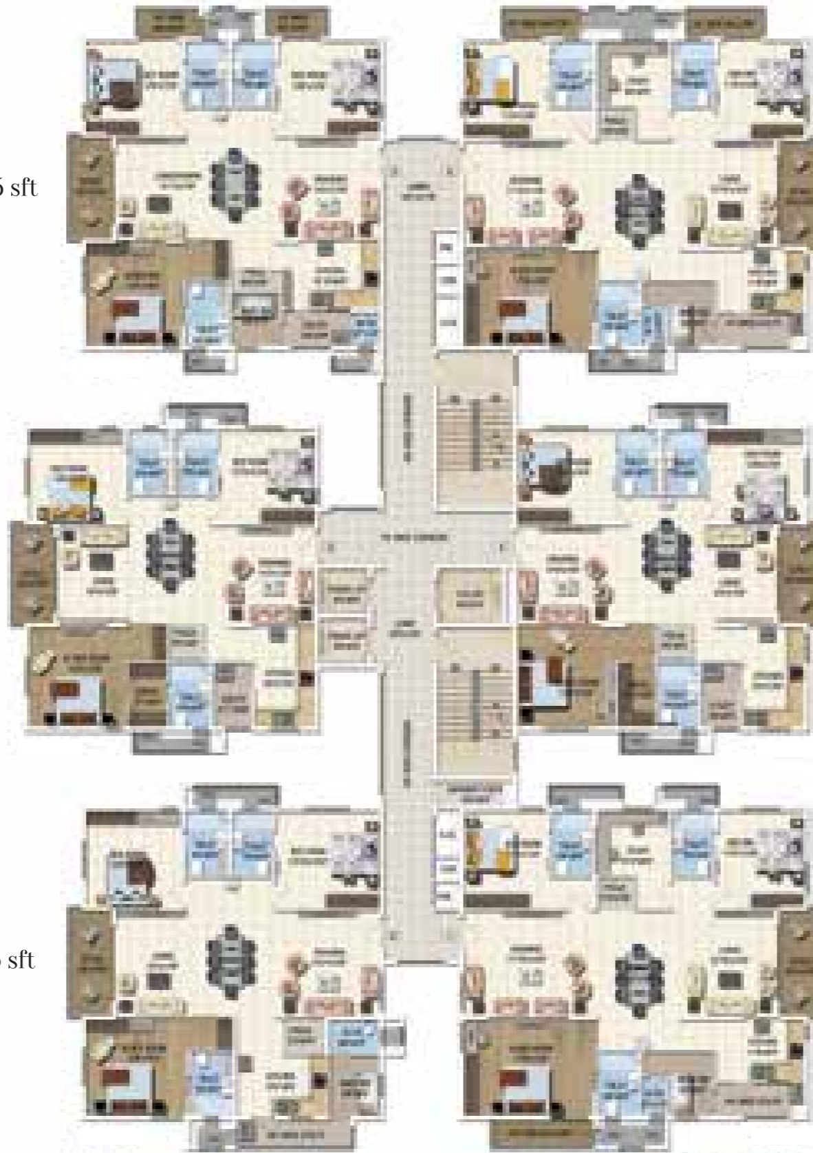
4, 6, 8, 10 TO 18 - FLOOR PLAN