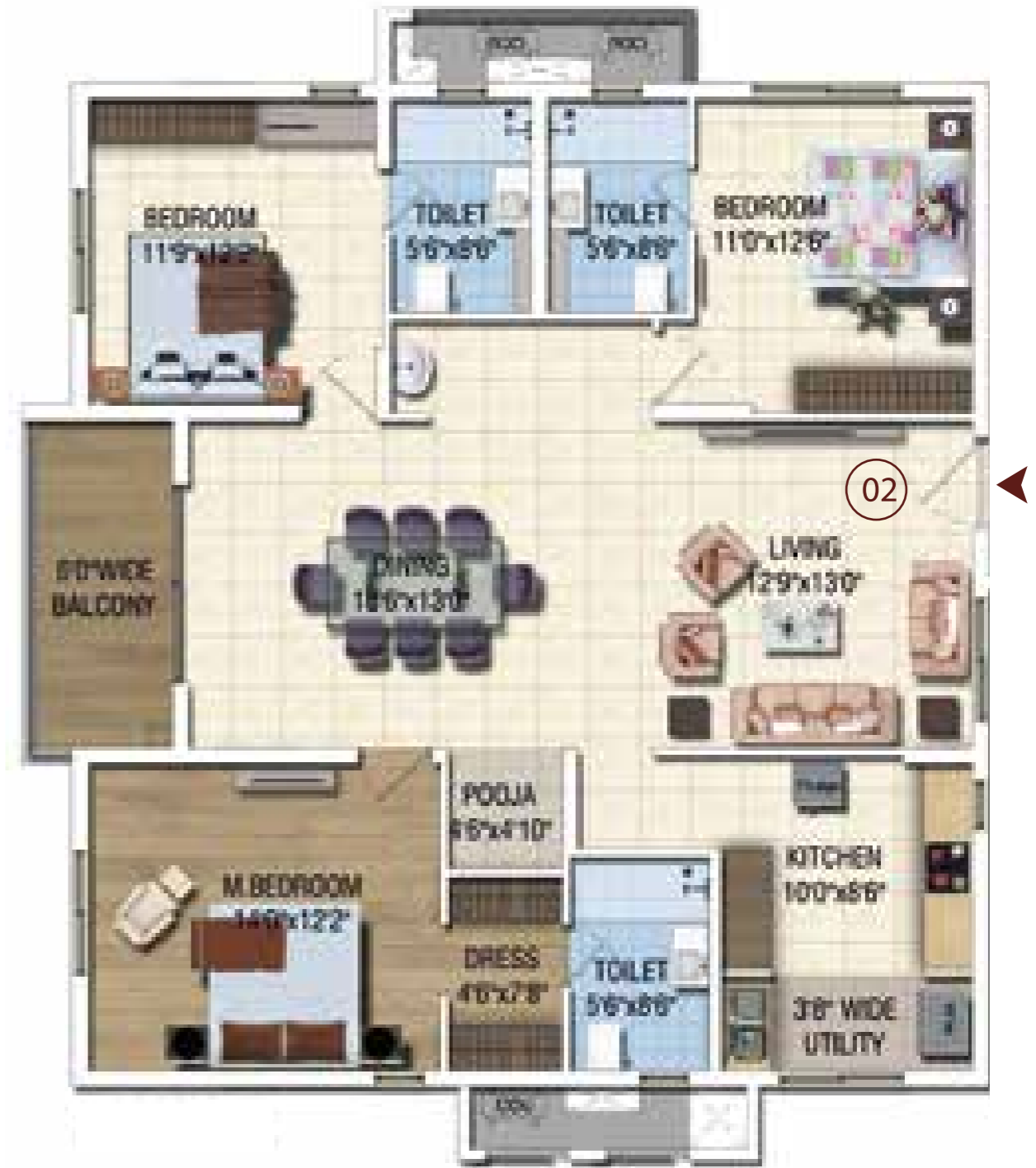
SBA - 1865 sft