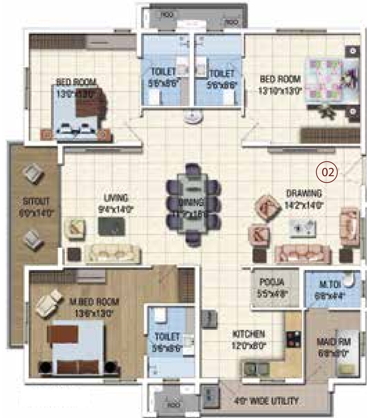
SBA - 2265 sft