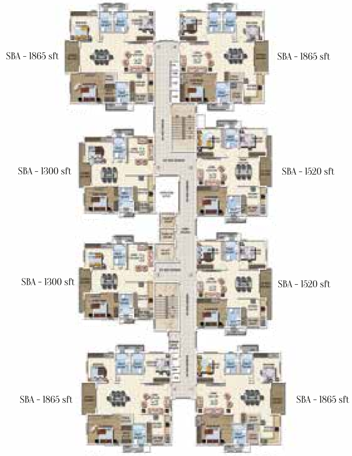
3, 5, 7, 9 - FLOOR PLAN