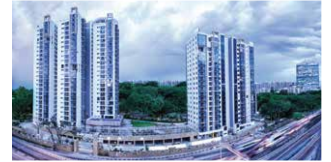
Luxuria 8th Main Malleshwaram, Bengaluru