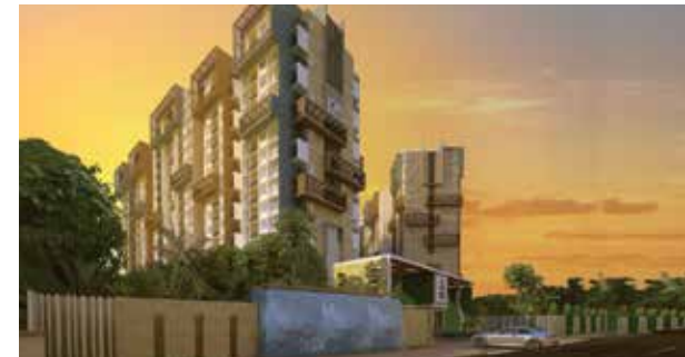
East Crest Budigere Cross, OMR, Bengaluru