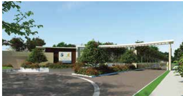
Pipal Tree Magadi Main Road, Bengaluru