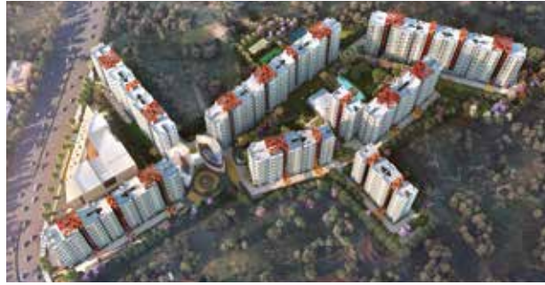
Park Cubix Devanahalli, Bengaluru