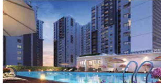
Divinity Mysore Road, Bengaluru