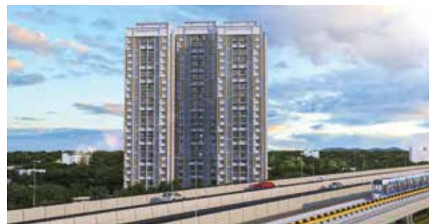
Opus Tumkur Main Road, Bengaluru