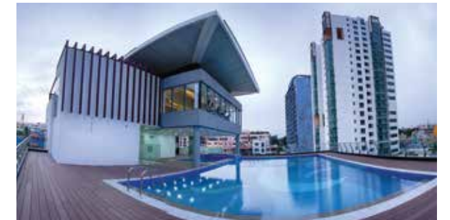
Magnificia Old Madras Road, Bengaluru