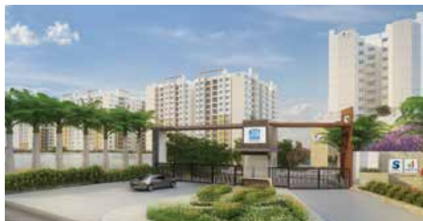
Misty Charm Off Kanakapura Road, Bengaluru