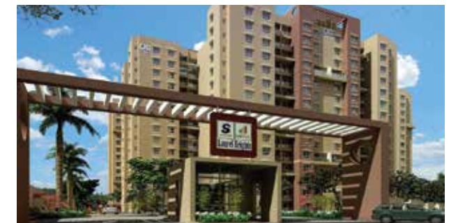
Laurel Heights Hesarhatta Main Road, Bengaluru