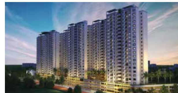
Cadenza Hosur Main Road, Bengaluru