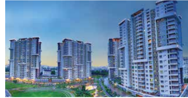
Greenage Hosur Main Road, Bengaluru