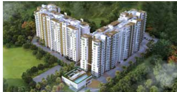
Navratna Residency Avinashi Road, Coimbatore